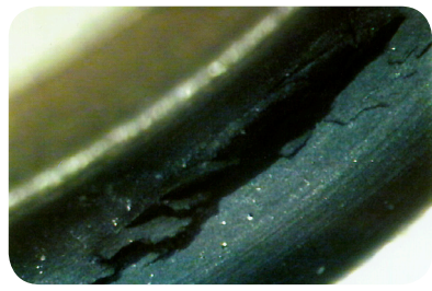
Production parts were disassembled and inspected throughout the investigation.