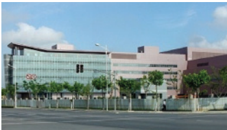
Shanghai Grace Semiconductor Manufacturing Corp. (GSMC), China