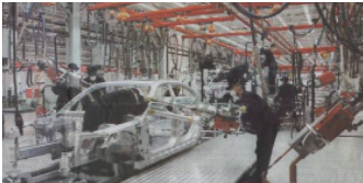
BMW Brilliance Automotive Assembly Plant China