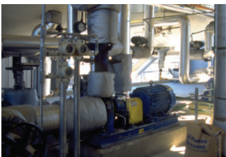
Akzo Nobel Coil Coating, China