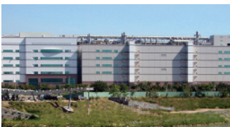
Chi Mei Optoelectronics Flat Panel Facility, Taiwan