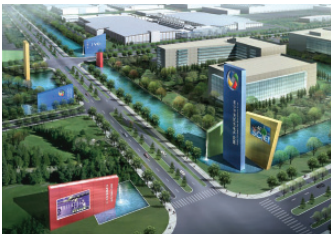
Kunshan Economic and Technical Zone Optoelectronic Village (KOV), China

CH2M HILL is a global leader in full-service engineering, planning, consulting, construction, and operations—and one of the few American companies licensed in China as a general construction contractor for both general building and public works projects.