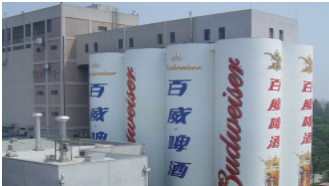
Budweiser International Brewing Company China