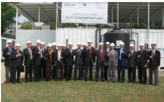
Hong Kong Water Supplies Department Pilot Desalination Plant Hong Kong