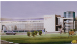
Tianjin Economic - Technological Development Area (TEDA), China