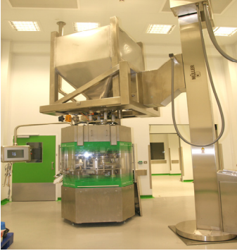
Servier UPA2 Facility, Arklow, Ireland

As a global leader in full-service engineering, project management, consulting, design, construction and operations, CH2M HILL combines international best practices with local expertise to provide solutions that add the most value to your business operations around the globe.