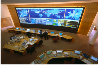
ESB, Dublin, Ireland