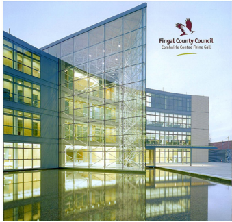
Fingal County Council, Dublin, Ireland