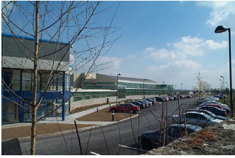
Alza Pharmaceuticals, Cashel, Ireland