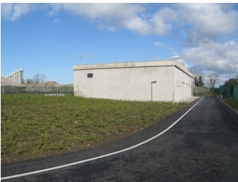
DAA Reservoir, Dublin, Ireland

Our Ireland office is located in Tallaght in Dublin. This office has successfully delivered technology-intensive projects of all sizes, ranging from less than €10,000 in fees to design/build projects exceeding €300 million.