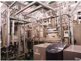
GeneMedix, Tullamore, Ireland